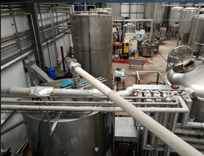
Left: inside the brewery with fermentation tanks in the background. Below: happy branch members on the way to Inverlmond