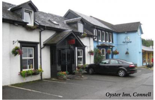
Oyster Inn, Connell

From here the coach moved northwards towards Oban, but before descending into the town we took a left turn down a single