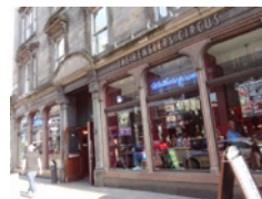
Where it started: the Henglers Circus in Glasgow